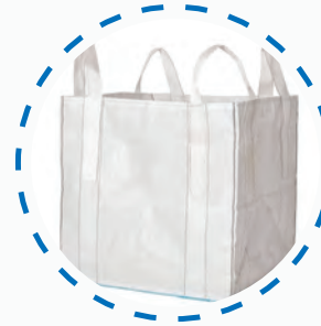
Cross Corner FIBCs