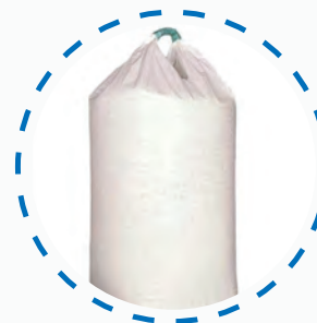
Single/ Double Loop FIBCs