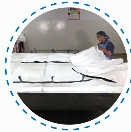
Light Inspection Room