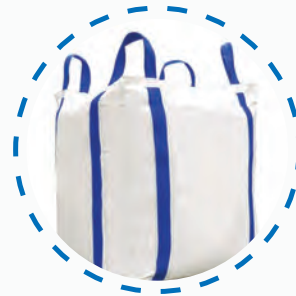
Form- Stable FIBCs