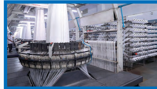
Circular Weaving Machines