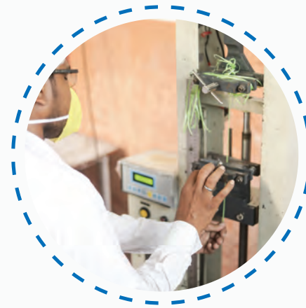
Equipment to measure Tensile Strength

At Shree Shakti, we believe in investing in quality today to hold edge over low pricing tomorrow and in the long term. Our systemic process of quality control and measure helps maintain transparency with our clients, vendors, partners as well as our grass root workers. Quality and high standard hygiene is a philosophy at Shree Shakti, it is what binds our product to our purpose and thus set us apart. The measures of quality are clearly stated and are expected to be followed by everyone involved in the process essentially, at every step.