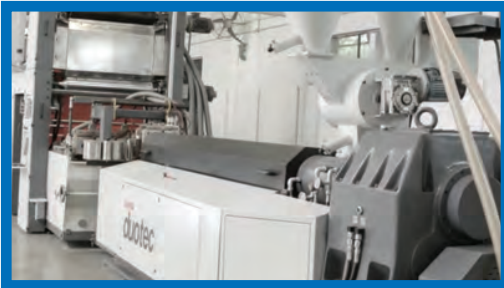
Extrusion Tape Liners

The Industrial Unit is fully self-operated and has 100% In-house operations.