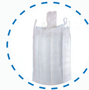
Dust Proof FIBCs