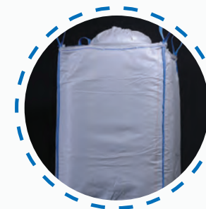
Tunnel Loop FIBCs