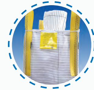
Type C FIBCs